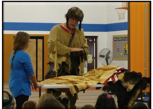
Experiencing a bit of the Lewis and Clark Expedition with this program by "Private George Gibson"