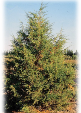
Rocky Mountain Juniper

The Two Chiefs project between the US Forest Service and NRCS project for Juniper removal was reauthorized for funding earlier this year. As a result, NRCS will be moving forward to develop additional Juniper Removal contracts. The Two Chiefs project assists producers who are having issues with Juniper encroachment on their rangelands. Although Rocky Mountain Juniper is a native tree in the ND badlands the historical lack of fire has allowed Juniper to encroach upon native grasslands. The project provides financial assistance to remove the juniper trees via mechanical means. The National Wildlife Foundation is also offering to assist producers with financial assistance above and beyond what NRCS can pay through the Two Chiefs project. If you are interested in this project and would like to discuss Juniper removal further please contact the office at 701-225-3811.