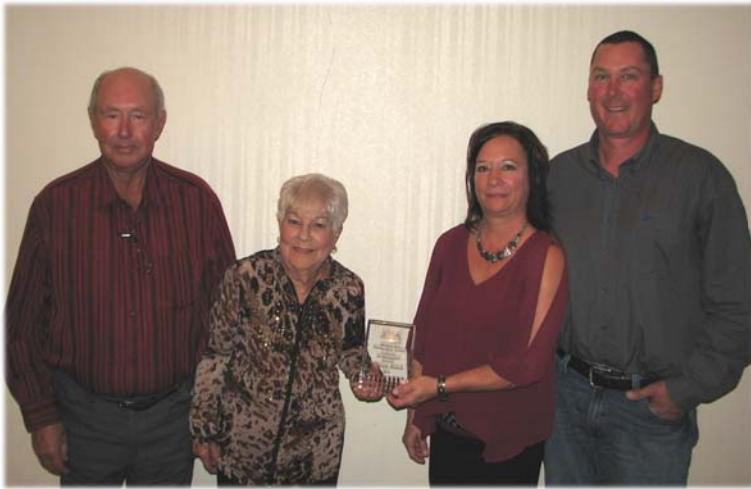
Swenson Ranch OVERALL ACHIEVEMENT AWARD Western SCD